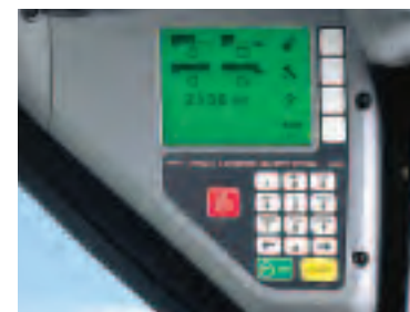
OPTIONAL Deluxe Instrument Panel