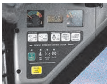
LEFT Side Standard Instrument Panel

provide dozens of operational features, diagnostics and monitoring. Optional deluxe instrument panel includes keyless start security system, feature lockouts, digital time and job clocks, multi-language display, even a "help" menu.