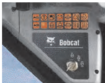
RIGHT Side Standard Instrument Panel